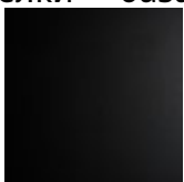
OP17 черный матовый