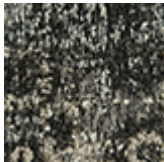
cotton chenille Mapoon