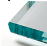
bevelled extra clear