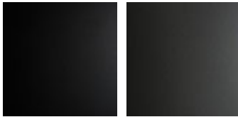
OP17 matt black