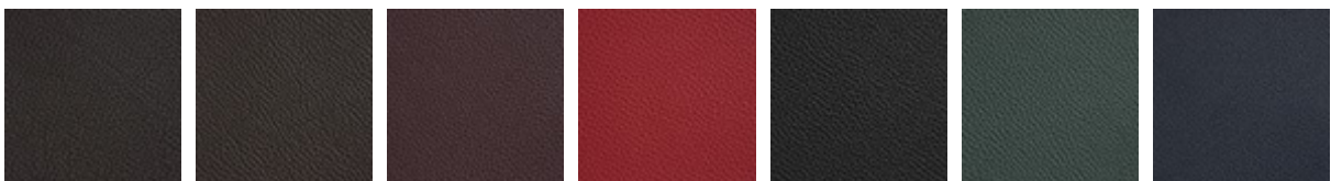
943 MOKA 891 TESTA DI MORO 944 BORDEAUX 989 ROSSO CORSA 973 NERO 987 SHERWOOD 940 NAVY