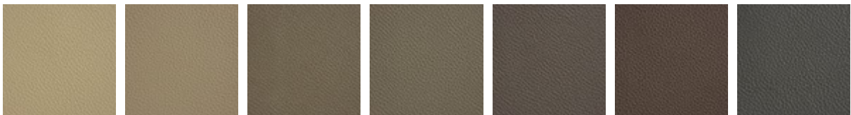
945 SAFARI 950 TORTORA 960 BRUNO 942 FANGO 946 MARRONE 988 TABACCO 952 SMOKE