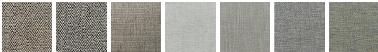
B720 B722 B403 B420 B521 B710 B711