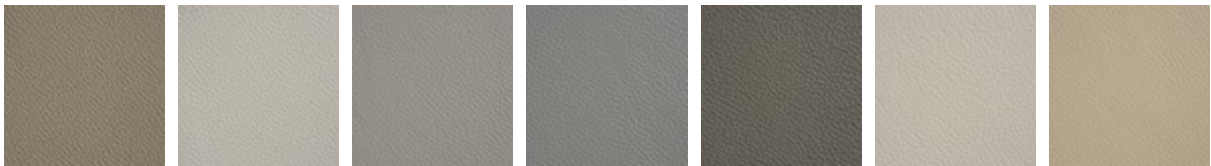
951 CASTORO 993 ARTICO 938 DAKOTA 995 NARDÒ 983 ARGILLA 948 LINO 969 CASHMERE