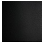
GFM73 black embossed