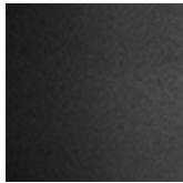
GFM69 graphite embossed