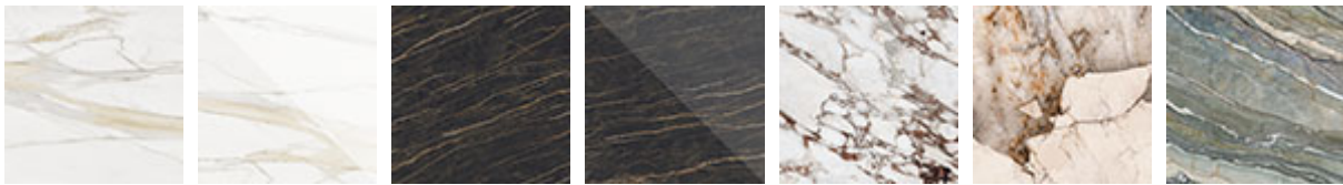
KM05 matt Golden Calacatta