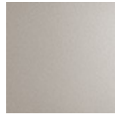
GFM70 pearl embossed