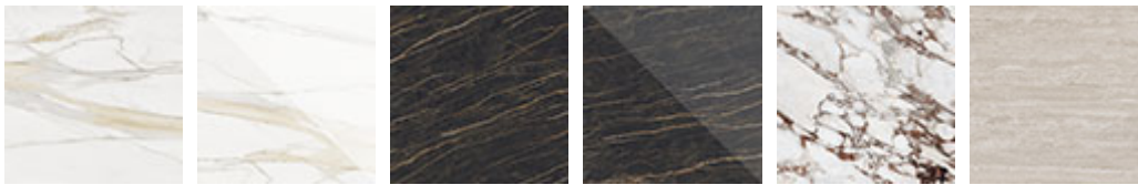
KM05 matt Golden Calacatta