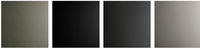
GFM11 titanium embossed