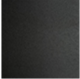
GF69 embossed graphite