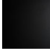
OP17 matt black