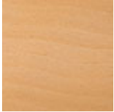
F1 natural stained beech