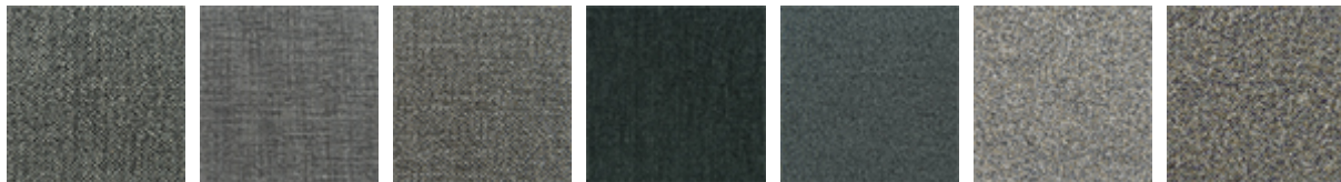
B540 B522 B541 B531 B421 B220 B221