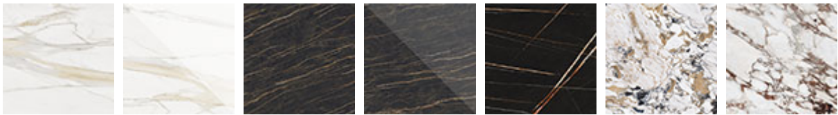
KM05 matt Golden Calacatta