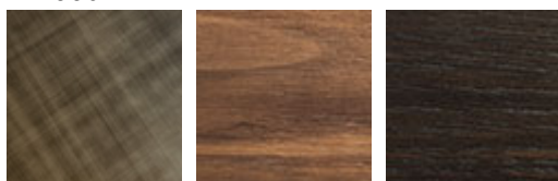
brushed bronze NC walnut canaletto RB burned oak