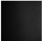
GFM73 black embossed