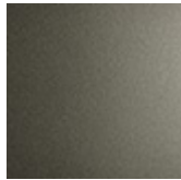
GFM11 titanium embossed