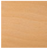
F1 natural stained beech