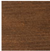
FNC walnut canaletto stained beech